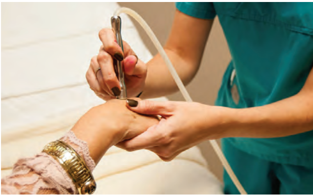
// PICOSECOND LASER IS A NEW TECHNOLOGY FOR AESTHETIC USE.

PICOSECOND LASER HAS SHORTER PULSE DURATION THAN TRADITIONAL NANOSECOND LASER. IT BECOMES A NEW TECHNOLOGY FOR AESTHETIC USE BECAUSE OF ITS EFFECTIVE TREATMENT TO REMOVE DARK PIGMENTATIONS.