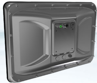
// Mounting with VESA 100 with M12 connector