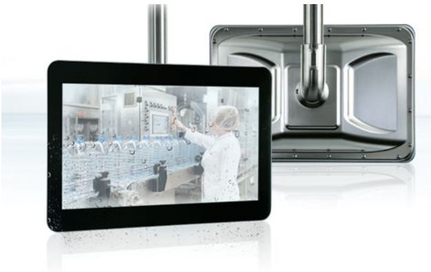
// FlatClient HYG - Scalable Panel PC with IP69K for hygienically sensitive production environments

Safe process visualization in the food and pharmaceutical industry - operating units with protection class IP69K. Complete dust and moisture encapsulation is particularly important for display and operating units that are used directly on a machine. Only a completely closed and optimally sealed housing with smooth surfaces that are as free of joints as possible prevents dirt and food residues from sticking and thus simplifies cleaning.